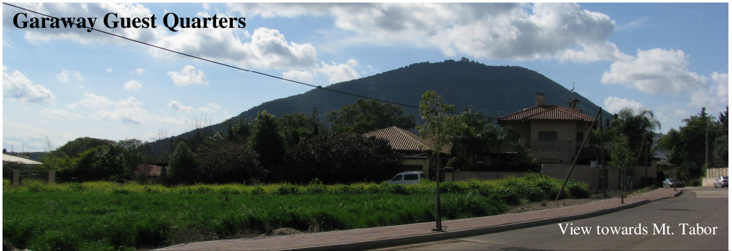
View towards Mt. Tabor

We offer a clean, quiet and inexpensive place for you to stay while visiting the Galilee. We can accommodate up to 2 couples or a small family.