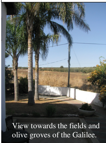
View towards the fields and olive groves of the Galilee.

or give us a call: (+972) 054 - 485 75 17