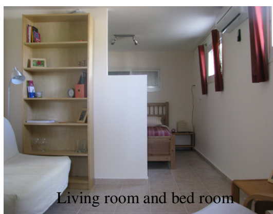
Living room and bed room